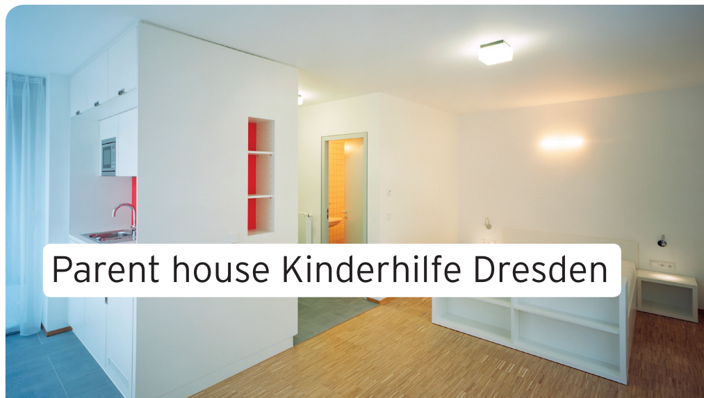
Parent house Kinderhilfe Dresden